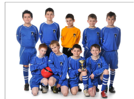
St Catherine of Siena Catholic Primary School Football Team A. 2011

A very special Thank You+ once again is extended to Monster Play for their ongoing generosity. They offered us sponsorship and donated £1,400 to cover the cost of new football, netball and rugby sports kits.